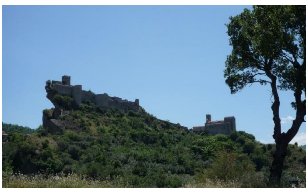
Castello di Roccascalegna

We aim to provide clients with a unique insight into an unspoilt and undiscovered part of Italy